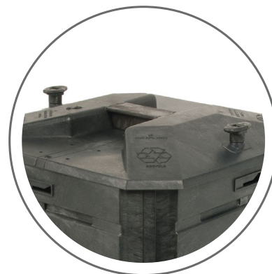
LARGE LOCKING LID HELPS TO KEEP WILDLIFE OUT