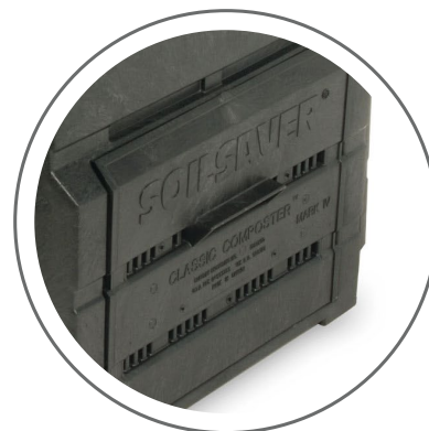
DUAL SLIDE UP DOORS