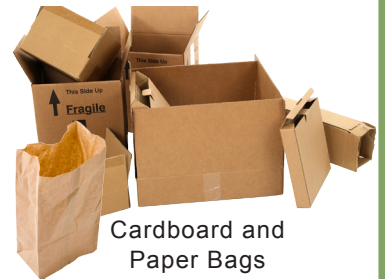
Cardboard and Paper Bags