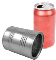
Steel, Tin and Aluminum Cans