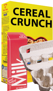
Paper Milk, Juice & Egg Cartons Cereal & Cracker Boxes