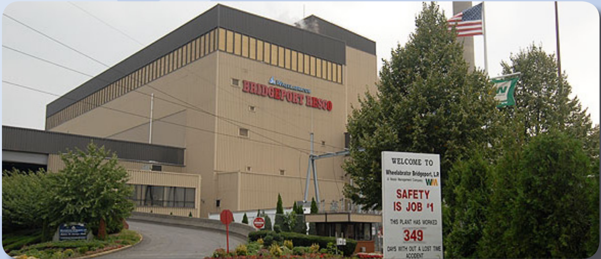
Wheelabrator Bridgeport, L.P. waste-to-energy facility