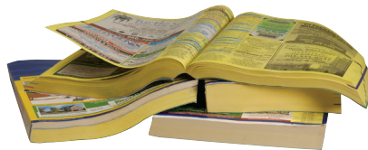
Phone Books & Paperback Books